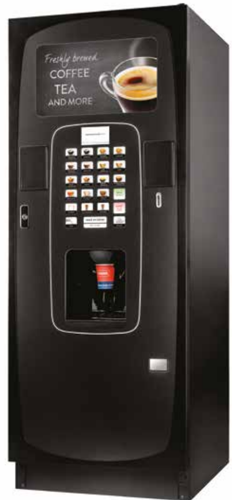
*Product shown with optional video screen